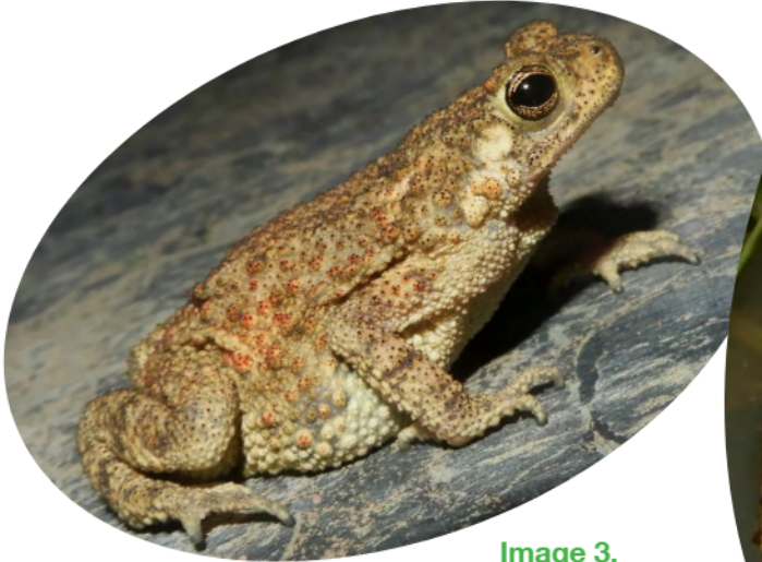
Image 3. Female of Duttaphrynus scaber .