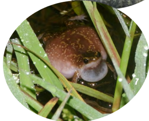
Image 5-7. Uperodon variegatus (5 – side view; 6 – dorsal view, 7 – calling male).

The males were observed to call while floating amidst the grasses in temporal water pools in grasslands and agricultural fields during the monsoon from July to September and the call can be described as like “quay–quay–quay”.