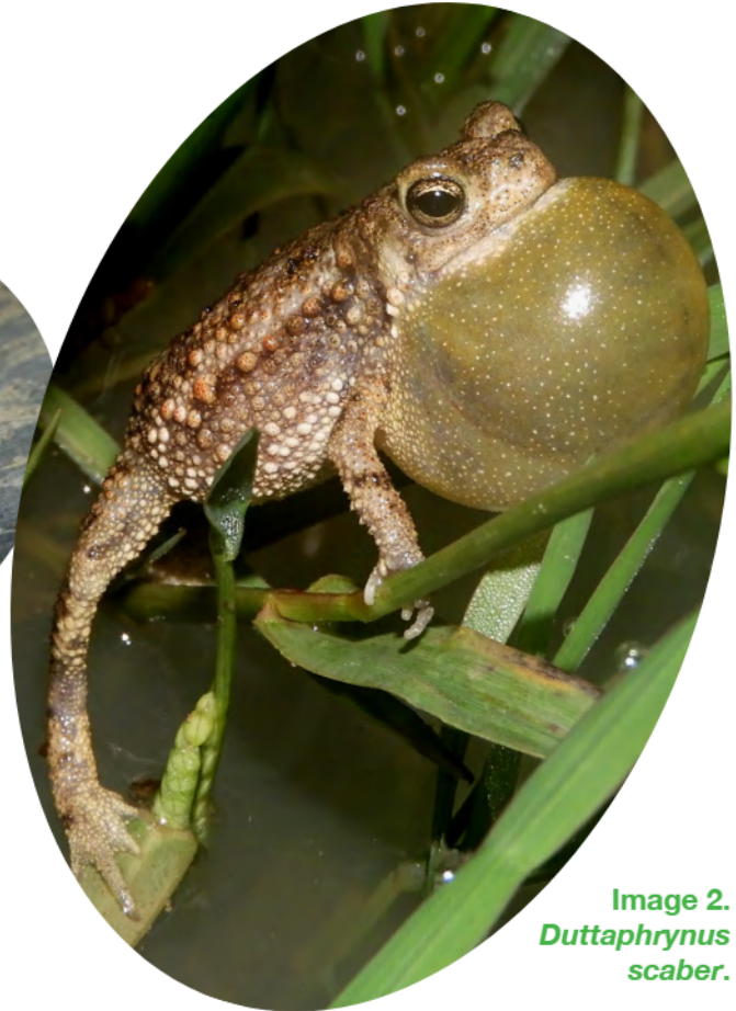
Image 2. Duttaphrynus scaber .