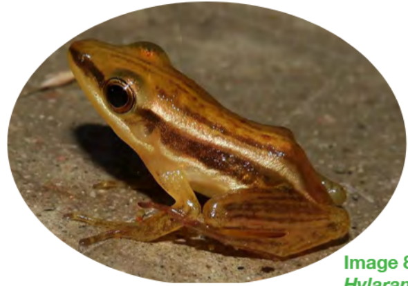
Image 8. Hylarana tytleri .

The lone individual from Pardaha was found to be sitting on the grasses in an agricultural field whereas the adult individual from Rabindrapally was observed to call from a grassland area. The call is very distinct and is often compared to the chirping of tailor bird (Image 8).