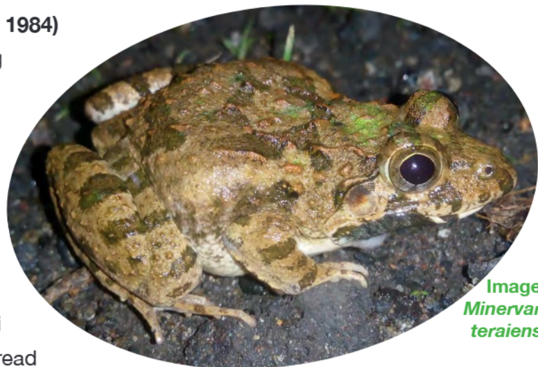
Image 4. Minervarya teraiensis .

Comment: One male on 17.vii.2018 was first observed from Pardaha area (23.5590°N, 87.3382°E) of Durgapur subdivision. Later, seven males on 25.vii.2019 were again observed from the same location. They were also recorded from other areas of Durgapur Subdivision.